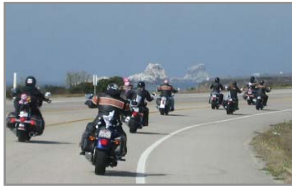
The Amazon Heart riders curve along the California Coast.

On September 15, 2007, several women, all breast cancer survivors, took off on the adventure of a lifetime, riding Harley-Davidson motorcycles from Los Angeles to San Francisco. They're raising funds and awareness for breast cancer as well as benefiting from the opportunity to spend time and share experiences with other women who have faced the disease.